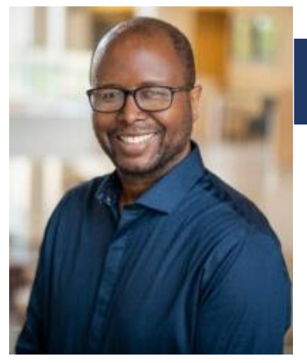
ASSOCIATED COLleges of the Midwest